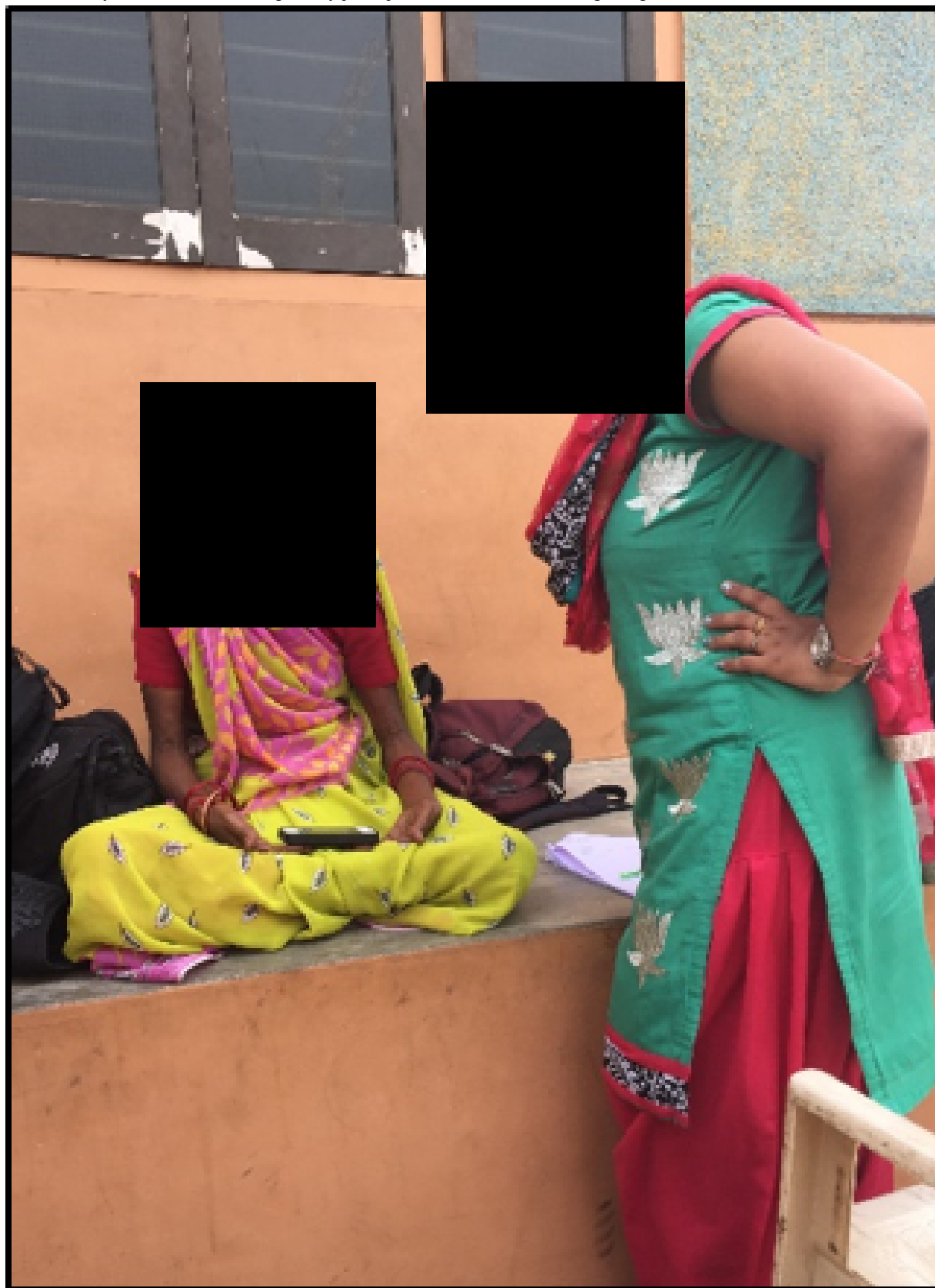
Figure 1. Community health worker screening a study participant for atrial fibrillation using a single-lead ECG device.